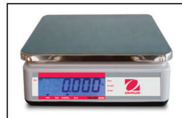
Rear display shown (dual-display models only)